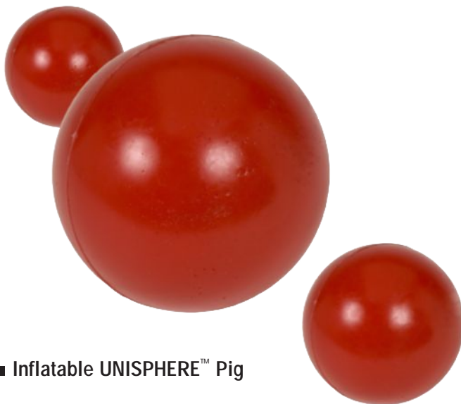
■ Inflatable UNISPHERE™ Pig

Bulletin No: 3010.001.02 Date: January 2007 Cross Indexing No: n/a Supersedes: 3010.001.01 (2/05)