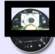
SW1 RIGHT CD42-T3 Default Transmitter Pattern