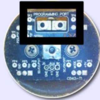
SW1 LEFT and SW2 RIGHT yields a default pattern CD42-T0, T1, T1A, T2