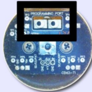
SW1 LEFT and SW2 LEFT yields a skip-one pattern CD42-T0, T1, T1A, T2