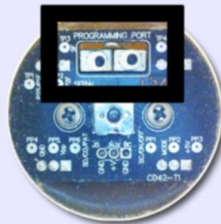
SW1 RIGHT and SW2 RIGHT yields a constant-on pattern CD42-T0, T1, T1A, T2