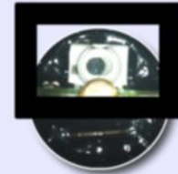
SW1 LEFT CD42-T3 Skip-One Transmitter Pattern