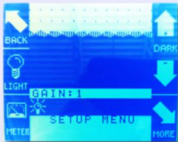
Constant-On Transmitter Pattern