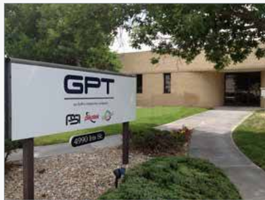
GPT Wheat Ridge, Colorado

At GPT we are committed to manufacturing and supplying only reliable, high-quality products that exceed our customers' requirements and expectations.