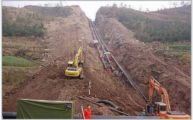
Typical Gas Line Installation in the United States

B7 Bolts coated with Xylan 1010 2H Nuts with Xylan 1010 coating Dual HCS Washer with X37 coating Fusion bonded epoxy coating G10 sleeve Dual seal G10 LineBacker® isolation gasket