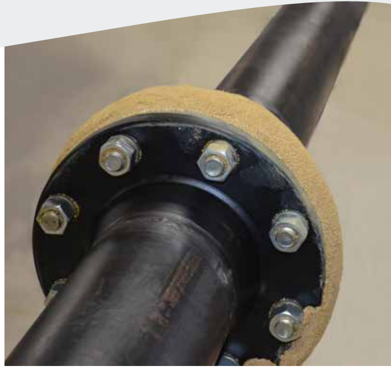
Fill-Pro PM-GP can be used to fill flanges prior to the application of Wax-Tape®.

A convenient and effective way to fill voids and smooth irregular profiles. Creates a more uniform surface for Wax-Tape application.