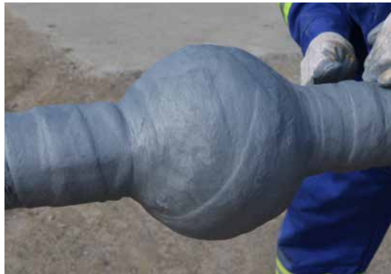
Use of Profiling Mastic creates a uniform profile for the application of Wax-Tape.